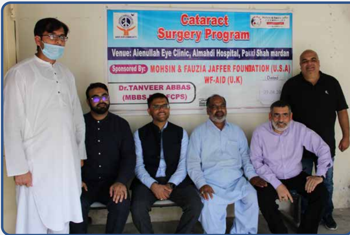
The WF Delegates at the Eye and Medical

Visit to the Aienullah Eye Clinic and Al Mahdi Hospital